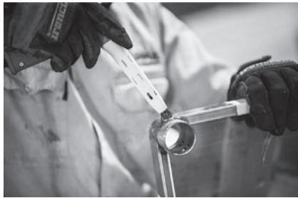
Propel Torch sold separately