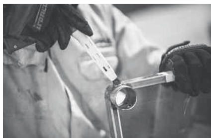
Propel Torch sold separately