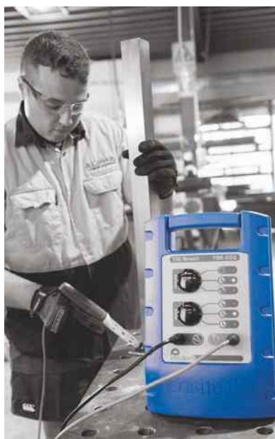
TBX-550 sold separately