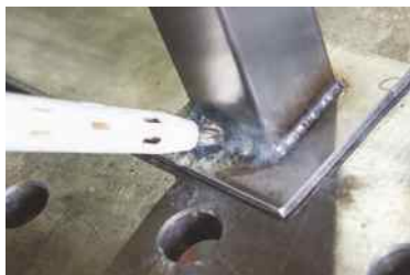
Concentration of power to the weld